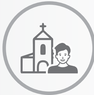
Pastoral Member Care