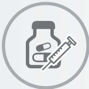
Prevention of Drug Abuse