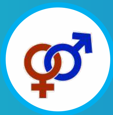
Gender & Development