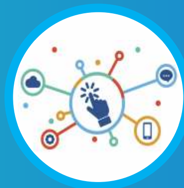
Networking Coordination & Collaboration