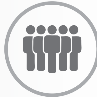
Children & Youth Development